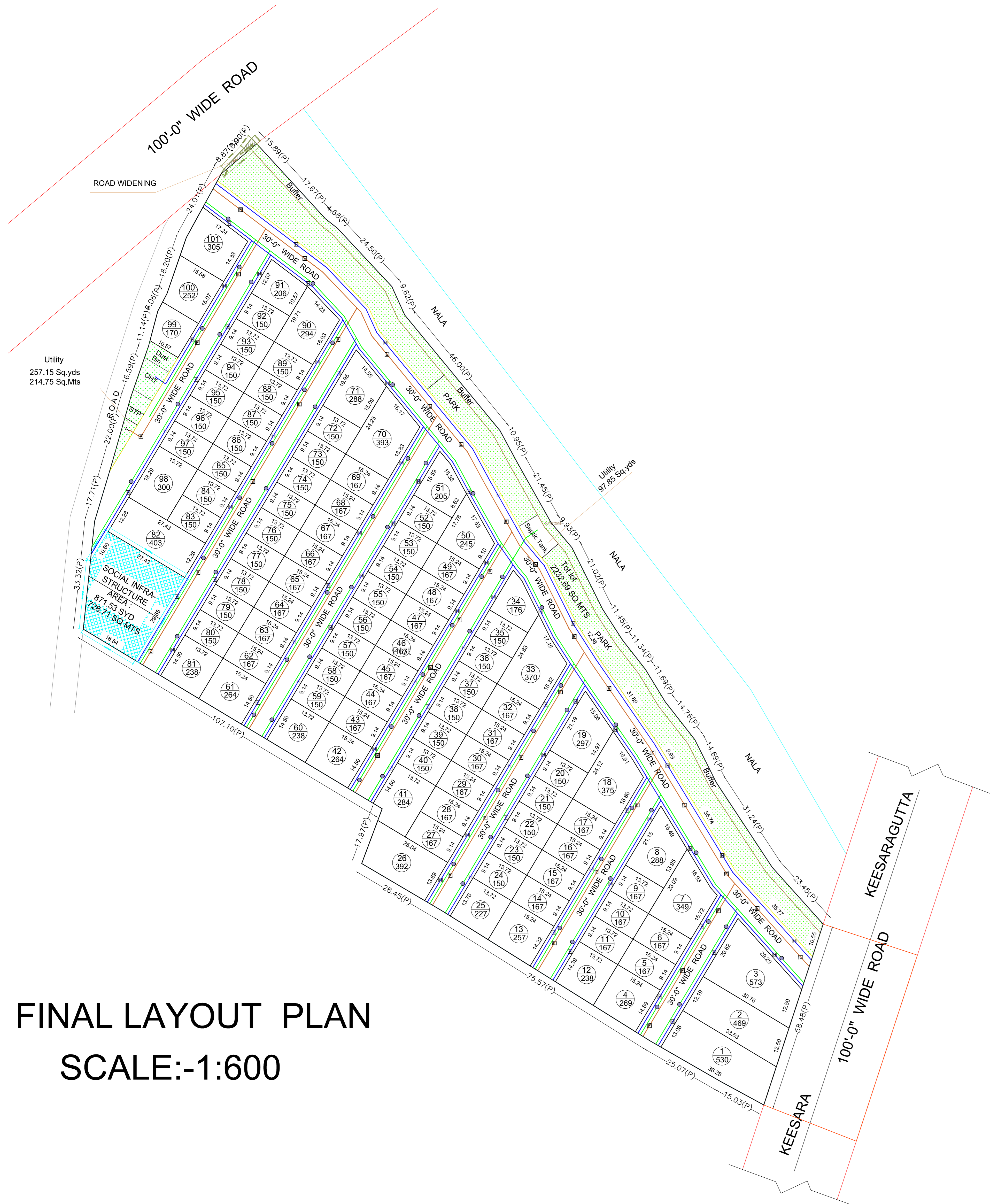
FINAL LAYOUT PLAN SCALE:-1:600